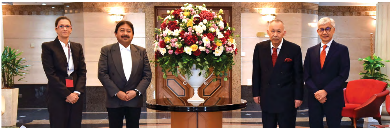
Group photo with former Chairmen of Bursa Malaysia - Engagement Session with Former Chairmen of KLSE/Bursa Malaysia on 10 February 2020 (From left to right)